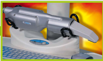
1. Intra-Oral Scan of Patient Example: iTero®