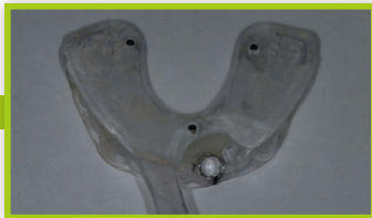
6a. Surgical Planning 6b. Lab Fabricates Surgical Guide Based on Surgical Plan