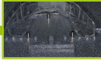
4. gonyX™ Laboratory Fabricates Scan Appliance