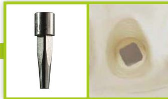
8. Order iTero Milled Model with Repositionable Implant Analog