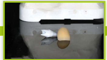
9. Import Mono Scanbody STL Data into CARES® Visual Software to Virtually Design Customized Abutment and Temp/Final Restoration