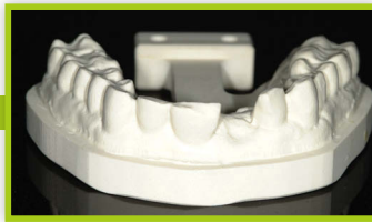
2. Order iTero Models 3. Send Model to Lab