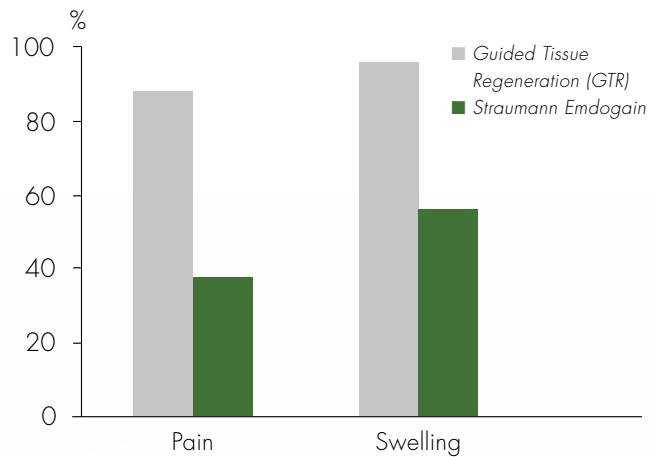
Percentage of patients with pain** and swelling** 1 week post-operative in furcation treatment with GTR or Straumann® Emdogain™ 14