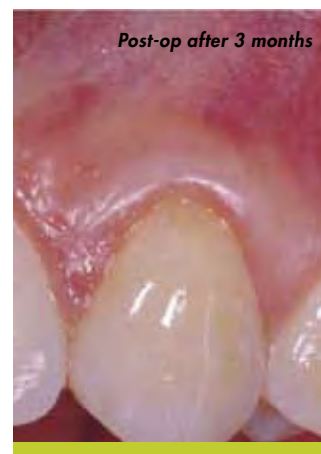
Emdogain in combination with a Caronally Advanced Flap (CAF).