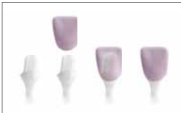
CARES X-Stream™: One-step prosthetic solution: One scan, one design, one delivery.

We offer a wide range of solutions and materials for you to choose from. There is no need for you to look anywhere else.