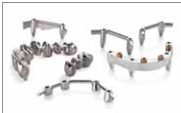
CARES Screw-Retained Bridges** and Bars: One solution for fixed edentulous cases.