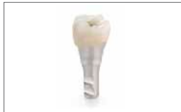
CARES Abutment, TAN*: Titanium alloy developed especially for direct veneering.