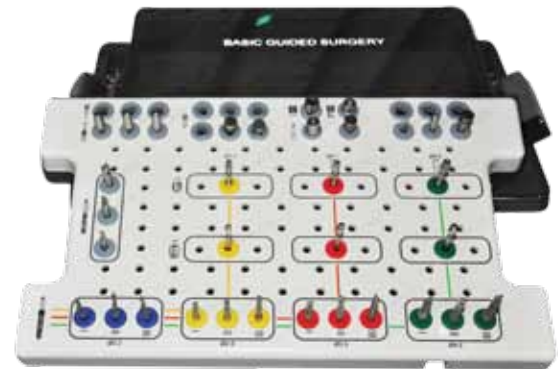
BL or BLT Basic Guided Kit

NOTE: The BL or BLT Basic Guided Surgery Kit is specific for Bone Level or Bone Level Tapered Implants. Fully Guided Surgery can be performed. A coDiagnostiX® Treatment Plan is required.