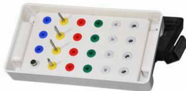
Basic Guided Pilot Kit - 2.8 mm

Starting with the 2.8 mm Twist Drill Pro through a 2.8 mm Guided Sleeve