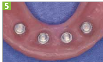
5 New mandibular overdenture.