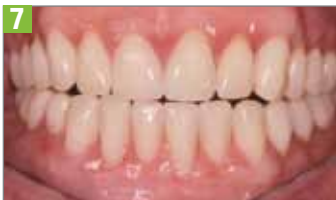
7 Upper and lower implant retained dentures.