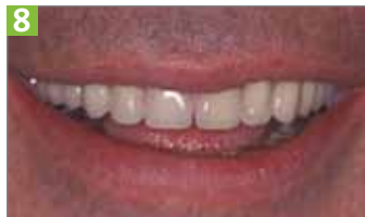
8 Improved facial esthetics and ideal function with new overdentures.