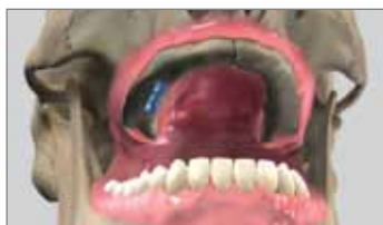
Delivery of implants