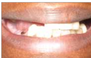
Current patient situation

Implant-supported, screw-retained restorations are removable by your dentist for maintenance