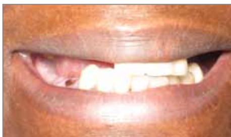
Teeth extracted prior to implant placement