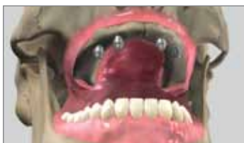
Implants in place and ready for provisional denture