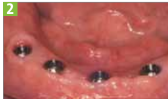
2 Four dental implants placed to retain lower denture in place.