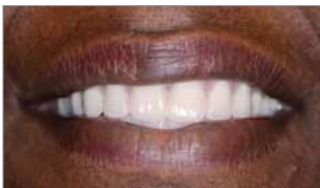
Final restoration in place