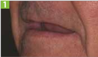
1 Edentulous patient with inadequate lip support and limited ability to chew.

Implant-retained dentures are removable by the patient