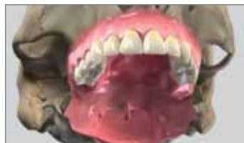
Provisional restoration in place