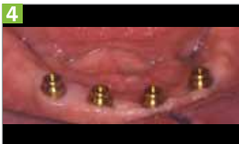
4 Locator® overdenture abutments in place.