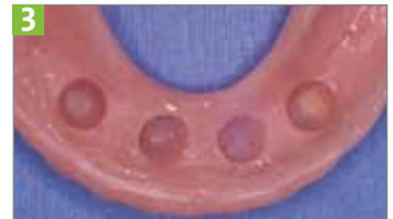
3 Lower denture prepared for attachment to dental implants.