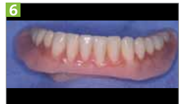
6 New mandibular overdenture.