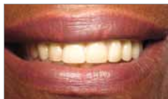
Patient on day of surgery