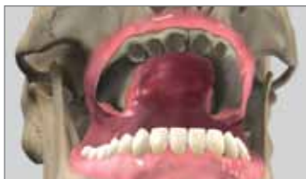
Teeth extracted prior to implant placement