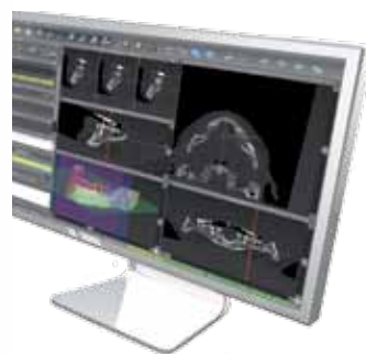
Digital treatment planning