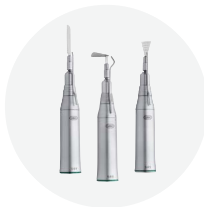
S-8 R S-8 O S-8 S

removal with sagittal, oscillating or reciprocal movement. Whichever direction you choose: with W&H, you will have a reliable partner at your side.