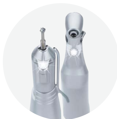
S-11 LED G WS-75 LED G