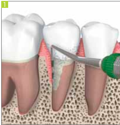
Periodontal checks reveal intrabony pockets – where gum tissue and bone have been destroyed.

Left untreated, plaque can spread and grow below the gum line. Toxins produced by the bacteria in plaque irritate the gums. The toxins stimulate an inflammatory response in which the body turns on itself, and the tissues and bone that support the teeth are broken down and destroyed. Gums separate from the teeth, forming pockets (spaces between the teeth and gums) that become infected (See Fig. 1). As the disease progresses, the pockets deepen and more tissue and bone are destroyed. Eventually, teeth lose their anchor, become loose and may have to be removed.