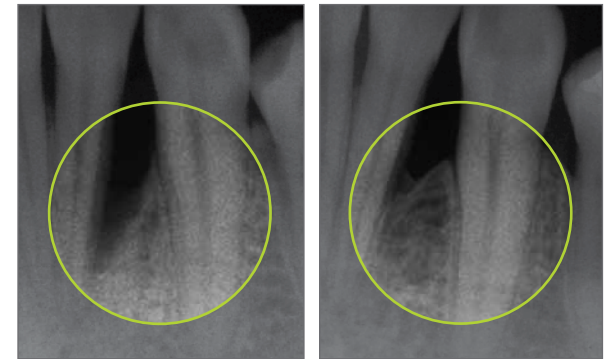
Before Emdogain treatment